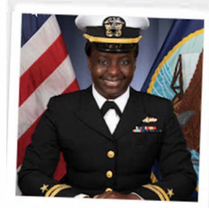
St. Thomas native serves aboard