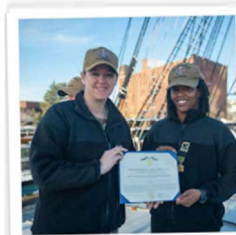
Caseyville native awarded Navy