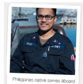
Philippines native serves aboard